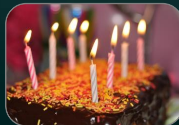
Birthday /Anniversary Offer