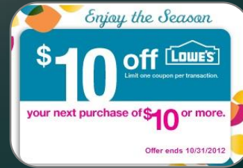
Cash Coupon (next purchase)