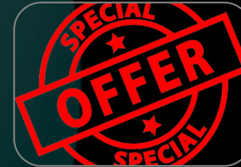
Return Discount (coupon)